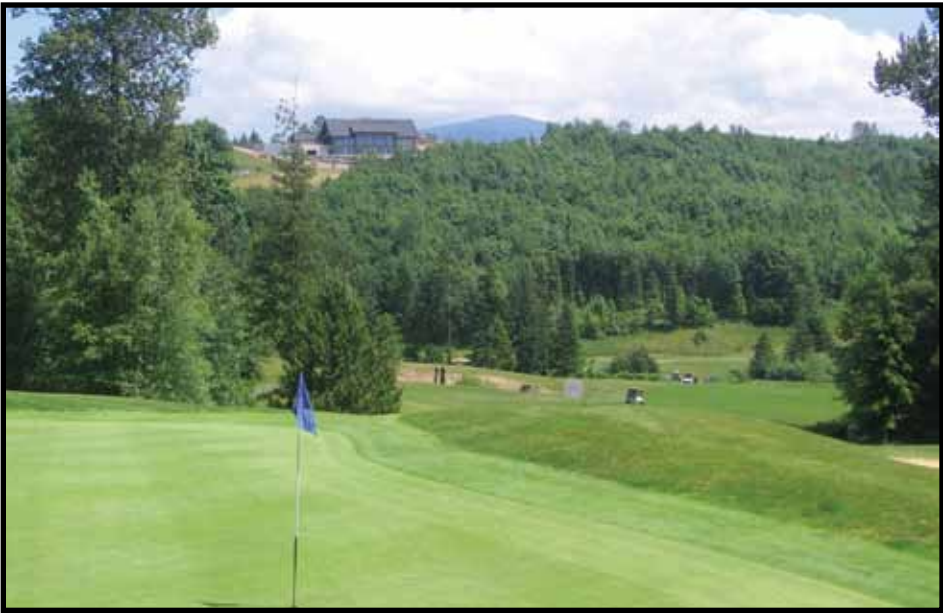
Elevation changes at Eaglemont in Mount Vernon offer some spectacular vistas.

In addition, it might not be one of the biggest or flashiest clubs around but Grays Harbor Country Club in Cosmopolis will serve up a pleasant round of golf. It has been around since 1912 with its distinctive nine-hole layout that winds through the trees and offers a dual-tee design.