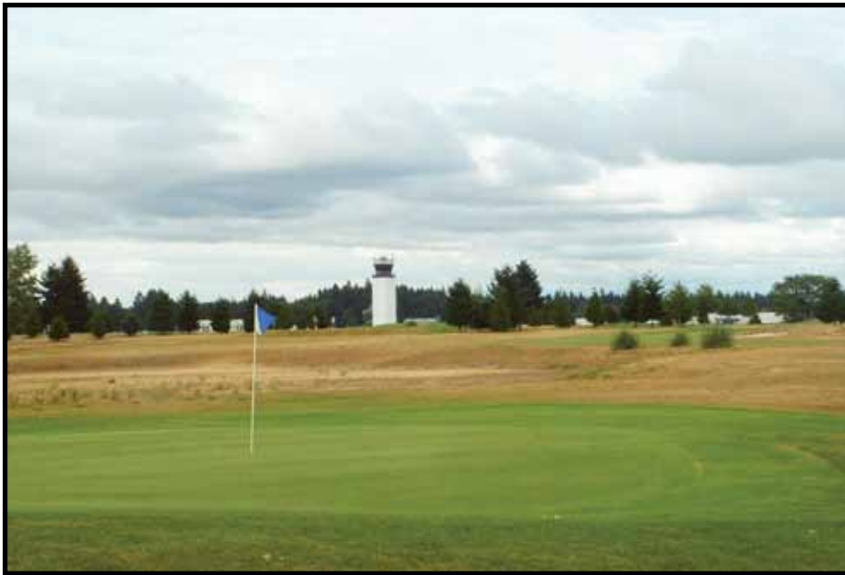
Airport Golf Center in Tumwater has a 9-hole course, driving range, batting cages and more.