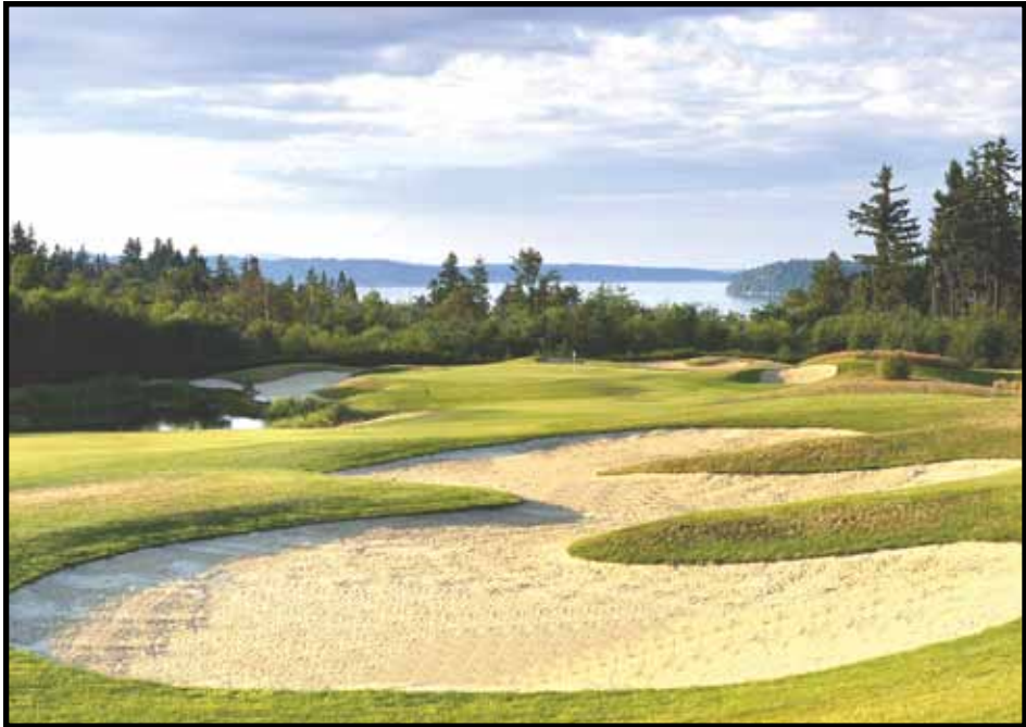
The Golf Club at Hawk's Prairie in Lacey has a Woodlands course and Links Course to try.

If you have driven up and down Interstate-5 south of Tacoma and north of Olympia, you have no doubt noticed the golf course to the west. That would be Eagle's Pride at Fort Lewis, a military gem of a course and a course that years ago opened its doors to the public. Eagles Pride features 27 holes of golf to try with its green, blue and red courses. It is a course that offers just about everything you would expect from Pacific Northwest golf with tall trees, sand, water hazards and a major freeway to the east. By the way, a ball hit onto I-5 is out of bounds. While Eagles Pride is open to the public, Whispering Firs is only open to active duty personnel, retired military, reservists, DoD employees working at JBLM, retired DoD civilians, and their respective dependents.