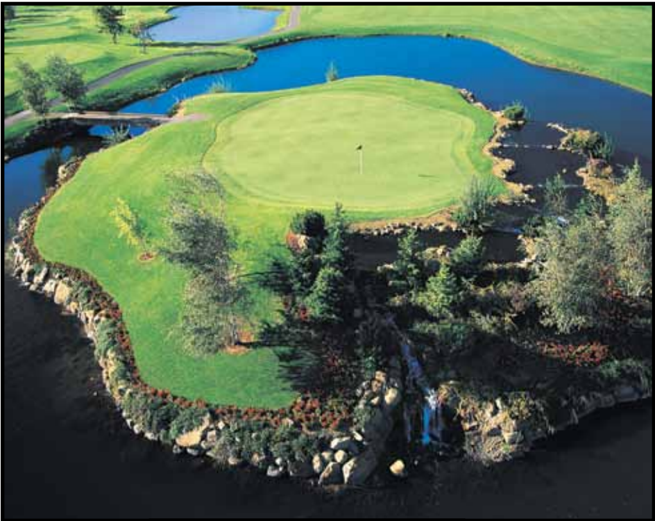
Homestead Golf Club features a par-5 with an island green for a finishing hole.

Semiahmoo features a tough one-two punch with hazard-filled hole Nos. 11 and 12. Water lines