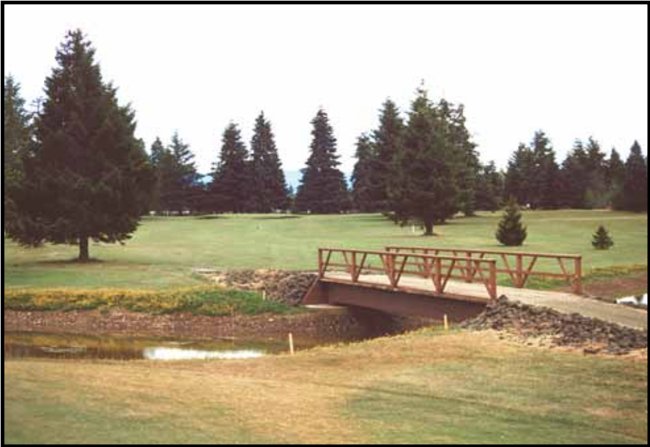
Oaksridge Golf Course in Elma is an easy stop along Highway 12 to the Coast.