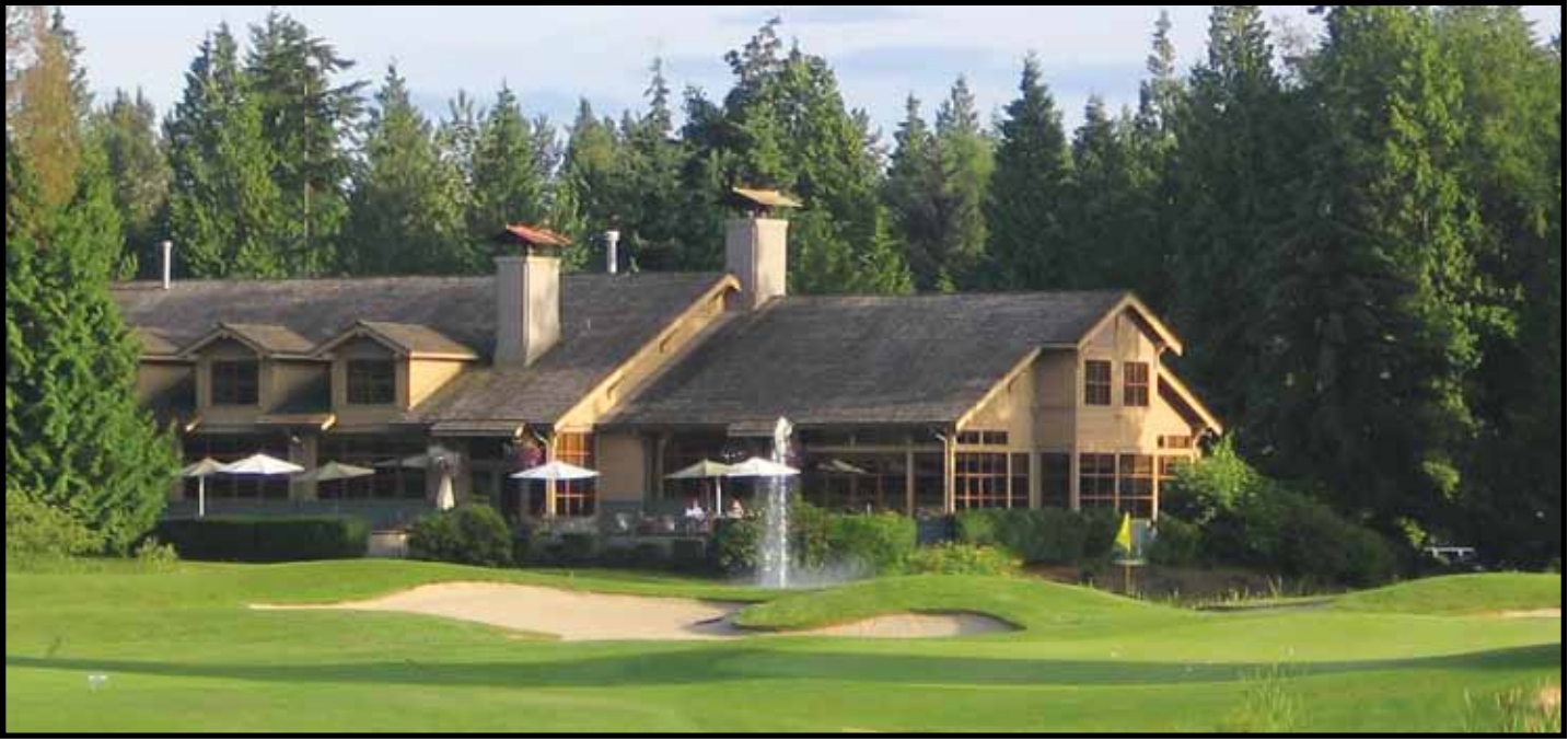
Semiahmoo Resort in Blaine is under new ownership and plenty of re-model work to the hotel has paid off since re-opening.