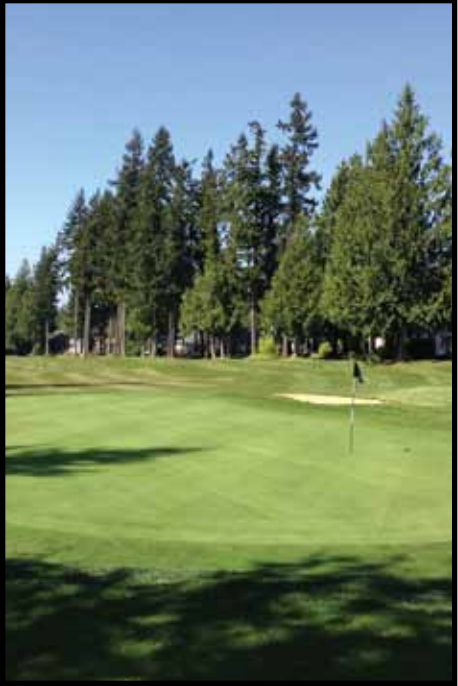
Kayak Point (left) and Gleneagle (right) are two choices on the way to Bellingham.