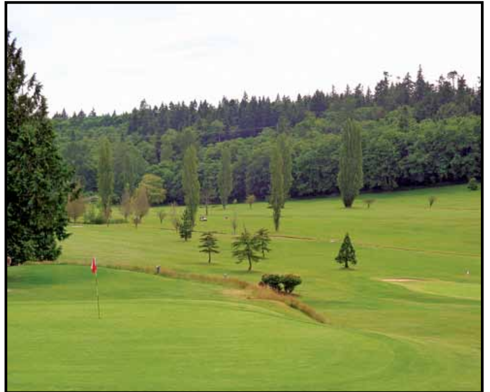
The Swinomish Tribe entered into the golf business by buying Similk Beach GC.