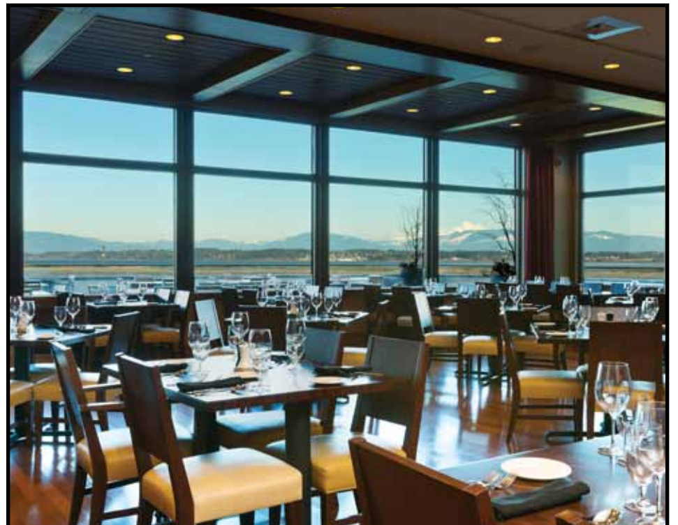
The Swinomish Casino is home to a hotel, RV lot, casino, restaurants and golf.