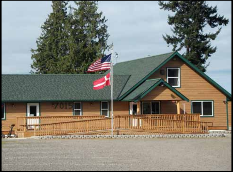
SkyRidge Golf Course in Sequim has a new clubhouse to show off to golfers.