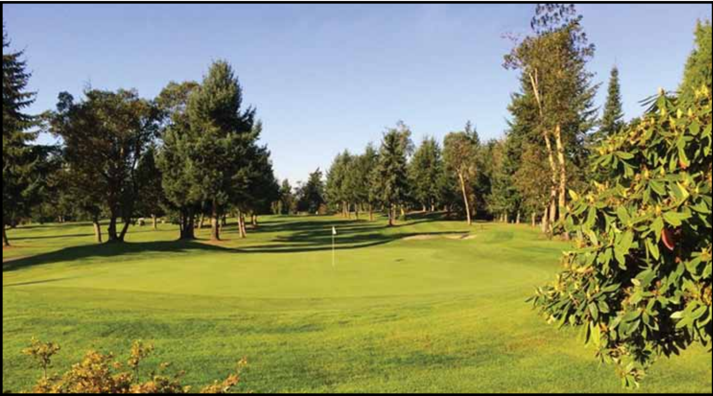
If you are on the way to the Kitsap or Olympic Peninsula, Madrona Golf Links near the Tacoma Narrows Bridge is a great option.