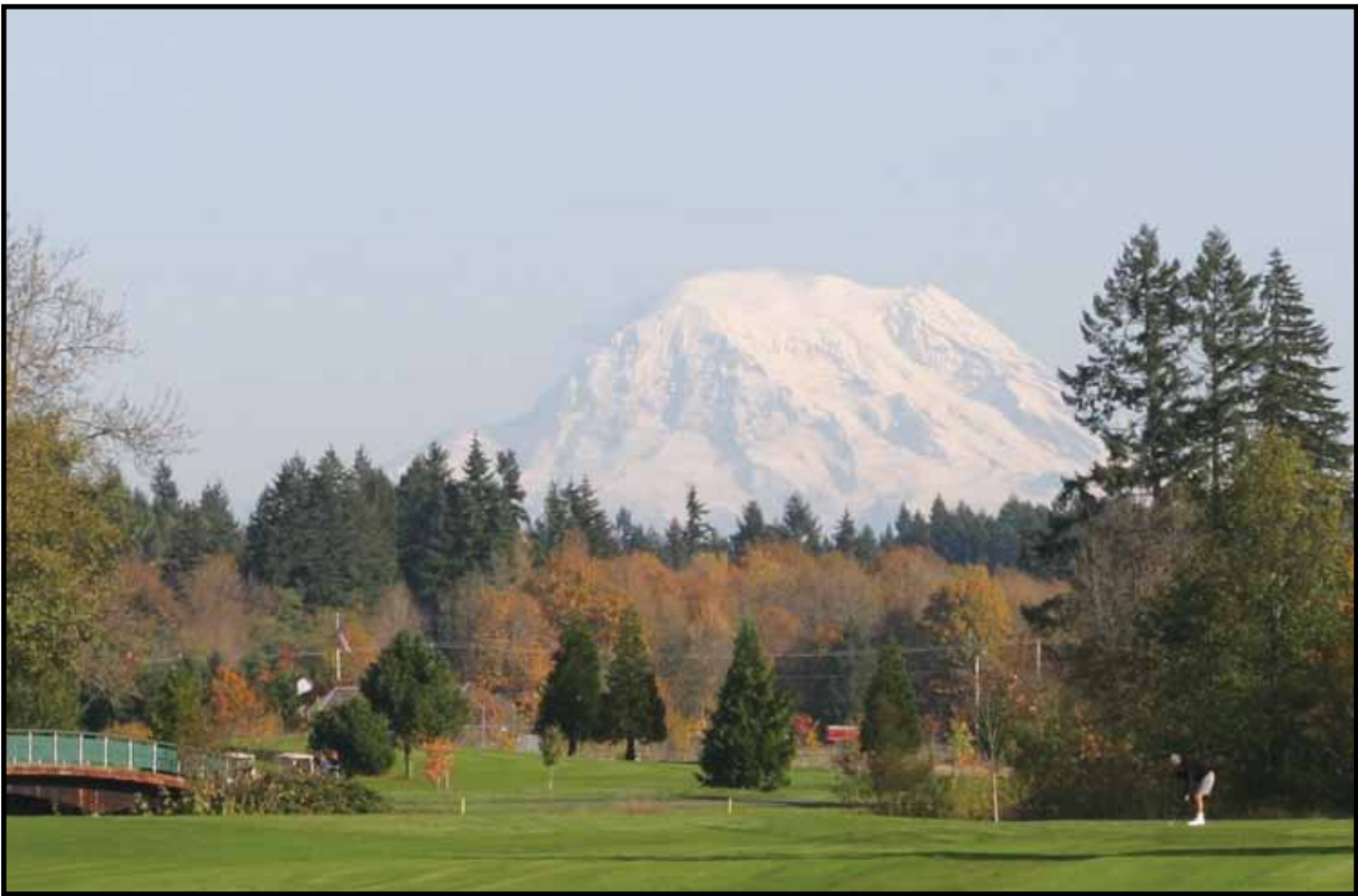
Lake Cushman (top) is located on the Olympic Peninsula; Tumwater Valley (above) has everything you need for practice or playing.