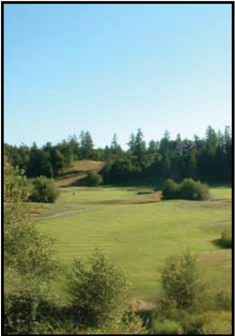
Shuksan Golf Course in Bellingham.