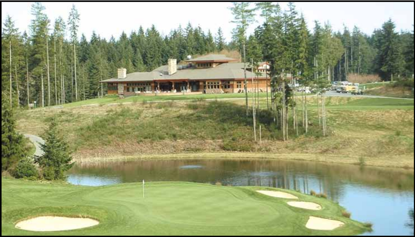
A couple of options along the Kitsap Peninsula include White Horse (upper right) and Gold Mountain (top) with its two courses.

Madrona Links is the kind of place that will challenge your golfing skills while not beating you up. There is enough sand and water to keep your interest through the 18 holes.