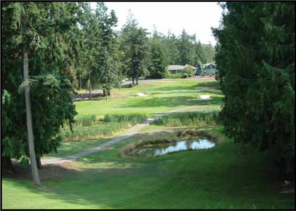
Tight fairways help make Sunland Golf & Country Club a challenging round of golf.

Tumwater Valley is known for many things, like its great condition, proximity to Interstate-5, reputation for hosting big tournaments – and a couple of par-3 holes that have two greens. Tumwater Valley can offer some variety with its par-3 holes. One day, giving them a shorter look, another a longer look with trouble off the tee. The course always is in top shape throughout the year. And its practice area is like nothing in the area - with a huge grass tee hitting area and a short game practice area.