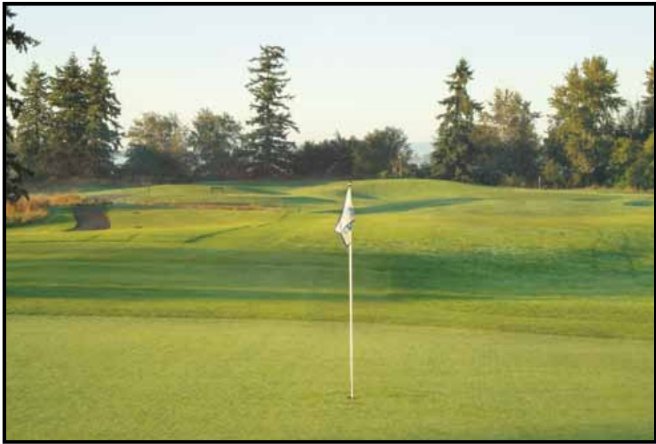
North Bellingham Golf Course offer a links experience that opened for play in 1995.

Sudden Valley Golf Club is known for its two distinctly different nines. The front nine, which winds